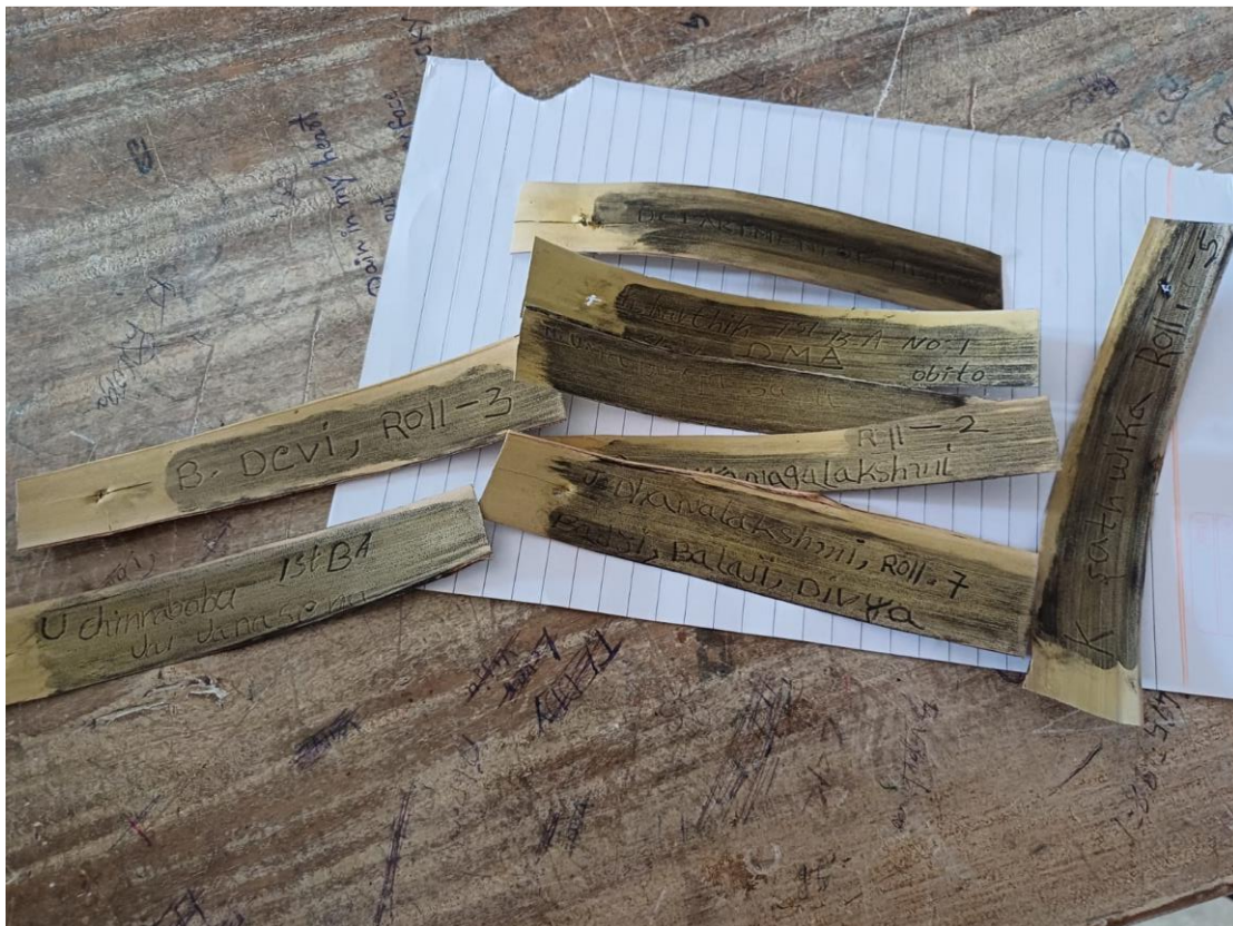
Wiping the colour