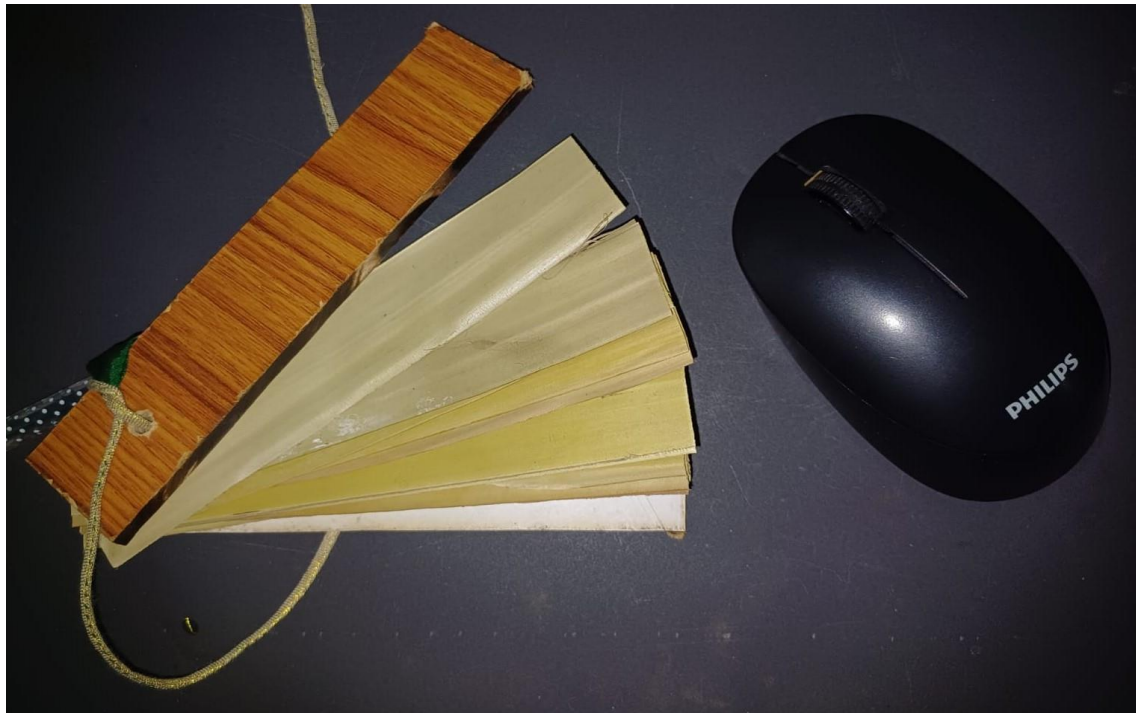
Ready to use Toddy leaf empty book

We can write anything on this todody leaf sheet with a needle or nail. The entire leaf is rubbed with colour and wiped off. Colour settles in the grooves made by nail/Ghantam. A mixture of mustard oil, haldi and camphor keeps the leaves away from insects.