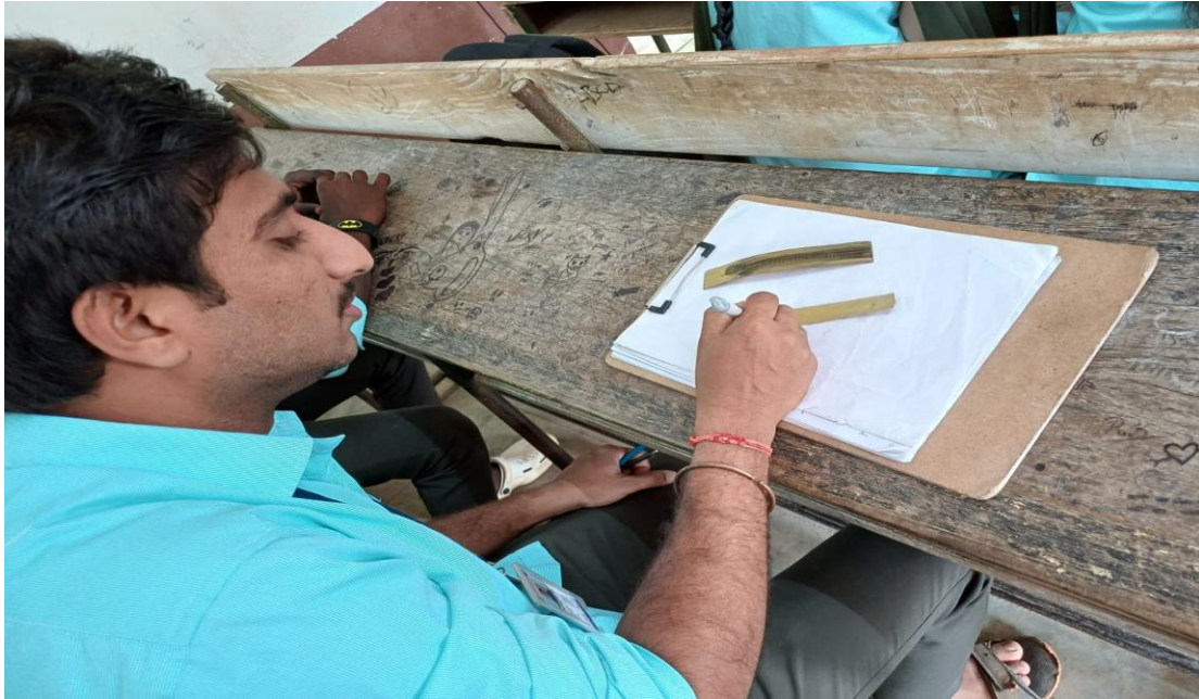
Writing on toddy leaf