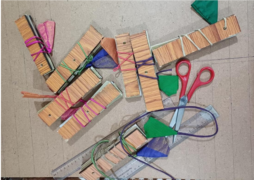
Outer cover made up of plywood