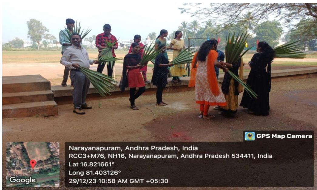
Collection of the leavels