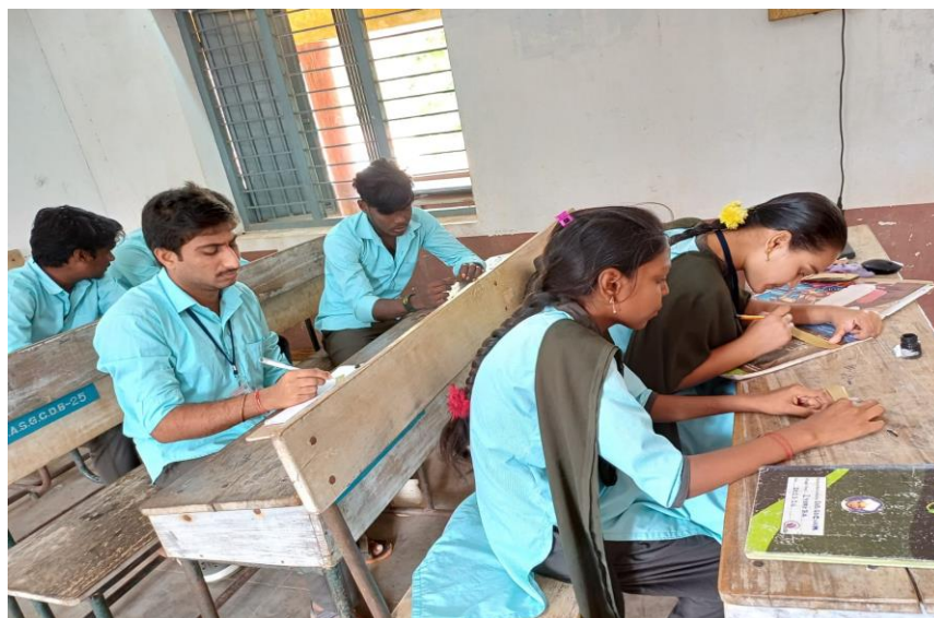
Students making the record