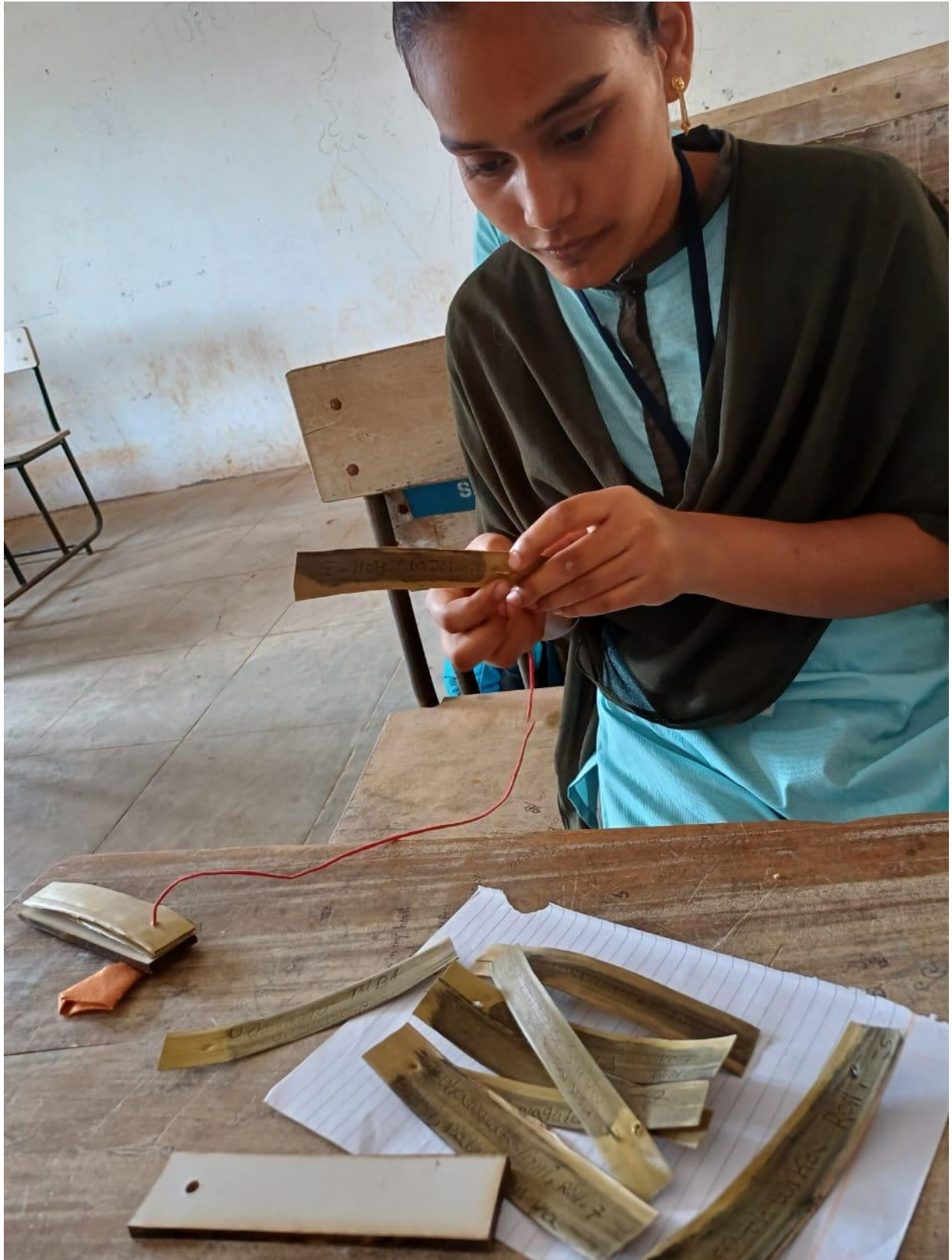
Making the book for future reference